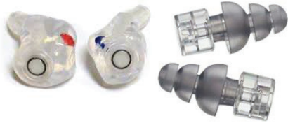
Figure 3. ER15 custom-made earplugs (left) and the one-size-fits-all ER20XS earplugs (right).

earplug that replaced most of the lost higher-frequency sound energy - the result was the world's first uniform attenuation (or flat) earplug. Low-frequency bass sounds, mid-frequency sounds, and higher-frequency sounds were all equally attenuated by exactly 15 dB. Figure 2 shows the uniform attenuation pattern for the ER15 for 50 people, along with the range for the right ear (red) and the left ear (blue). Except for one low-frequency outlier in the right ear, the attenuation pattern is rather consistent. The outlier may have been related to a measurement artifact where the measuring probe microphone may have caused a low-frequency leakage. Figure 3 shows a picture of the ER15 and its one-size-fits-all cousin, the ER20XS.